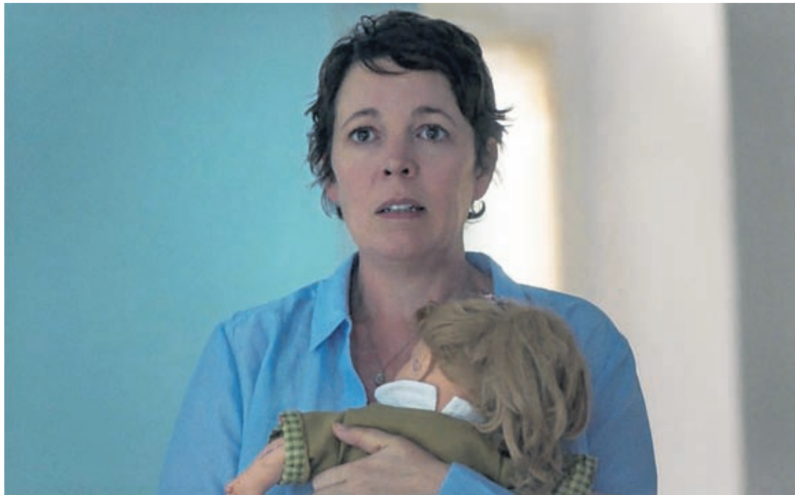
This image released by Netflix shows Olivia Colman in a scene from "The Lost Daughter."

But there's another facet to this film that makes it a rarity. On second viewing, what transfixed me was the synergy between older Leda and younger Leda, played by Jessie Buckley as a mother on the cusp of 30. Gyllenhaal interweaves their stories with a deft touch that deepens the connection as the film progresses, to the point where nary a doubt remains that they're